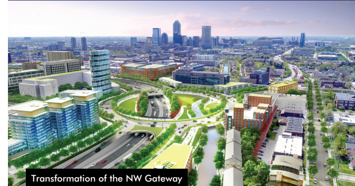
Transformation of the NW Gateway