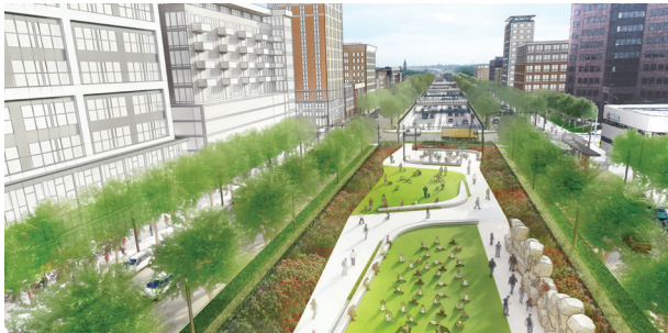
Transformation of the North Leg