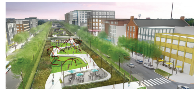
Transformation of the South Leg

Support Rethink Coalition, and together we can achieve the vision for a thriving region.